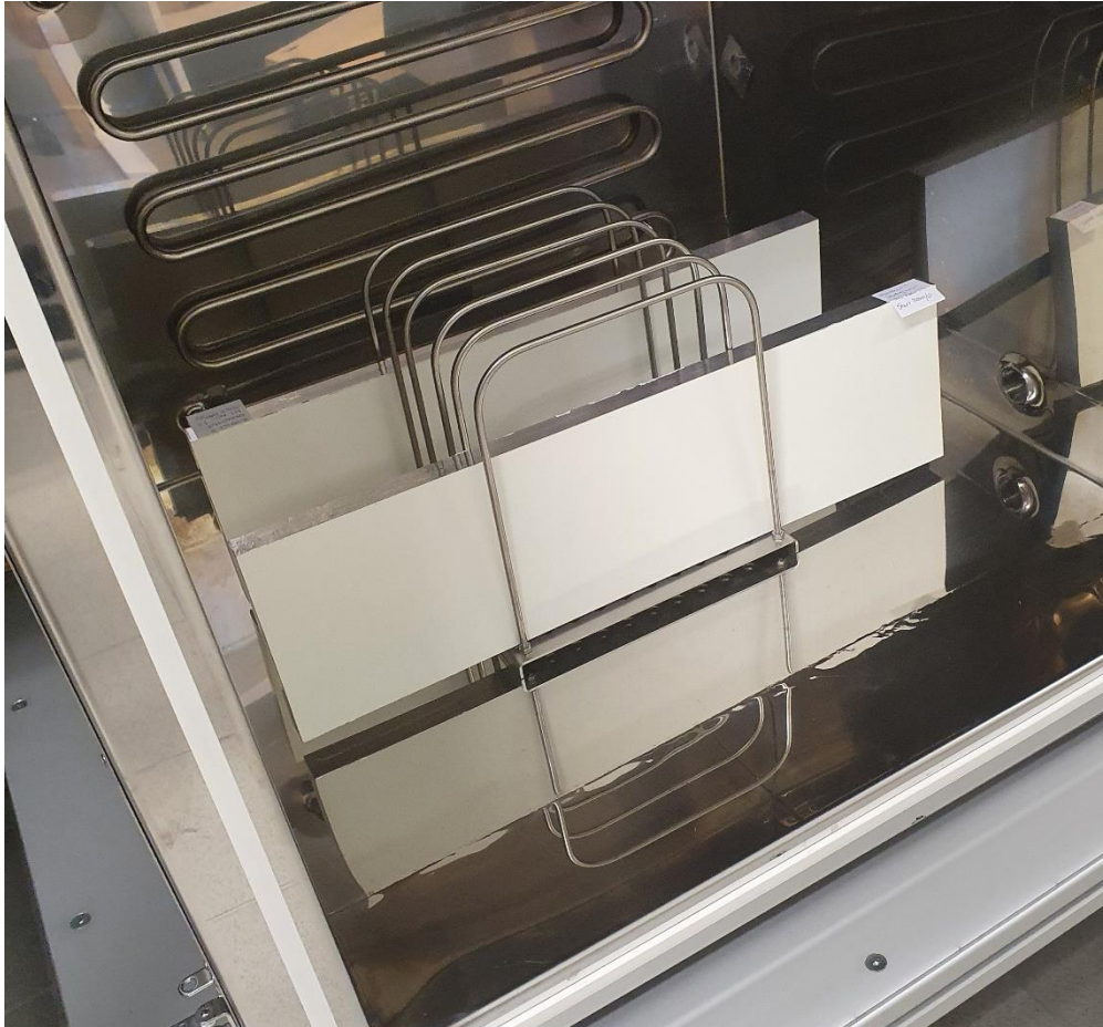
Specimens for the chemical emission